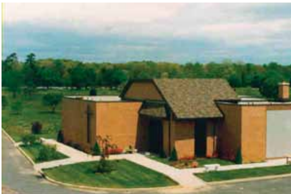
Central Islip, New York