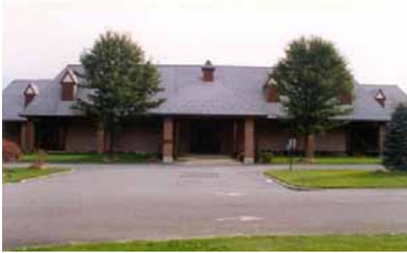
Westbury, New York