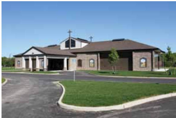
Coram, New York